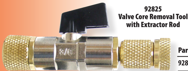
92825 Valve Core Removal Tool with Extractor Rod