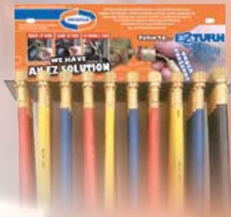
EZHR EZ TURN Hose Display Rack (Holds up to 50 Hoses)

Rated for R-410A, CFC, HCFC & HFC Refrigerants Maximum Working Pressure: 800 PSI Burst Pressure: 4000 PSI